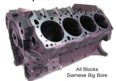
All Blocks Siamese Big Bore

Indy Stocks Hard To Find Mopar/Callies Blocks