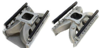
PS153781 Mopar 4150

Top Plates for Hemi EFI Base, 1x4, 2x4 or 3x2.