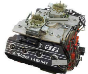
Pictured with Cross Ram / Holley Carbs