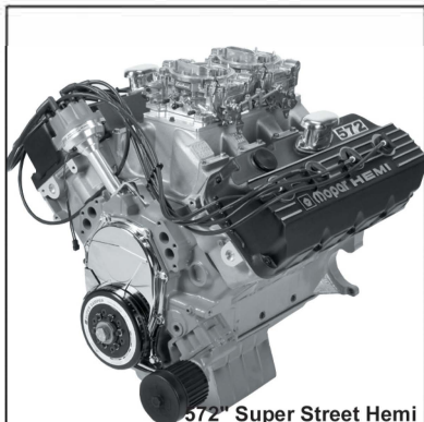
572" Super Street Hemi