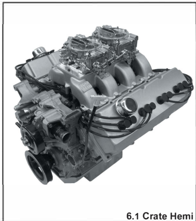
6.1 Crate Hemi

For nitrous blower and turbo combinations, a solid block version is available for added strength and reliability. Water is still circulated through the cylinder heads.