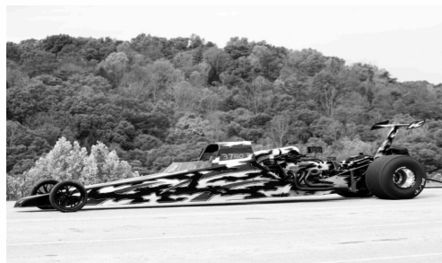
Ron Stayer Jr's 431 Low Deck Wedge 4.17 @ 169 Procharged Racedrive